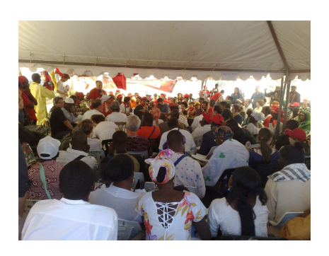
Reading the Dakar Declaration at Village des Habitants (Dakar, February 10<sup>th</sup> 2011)