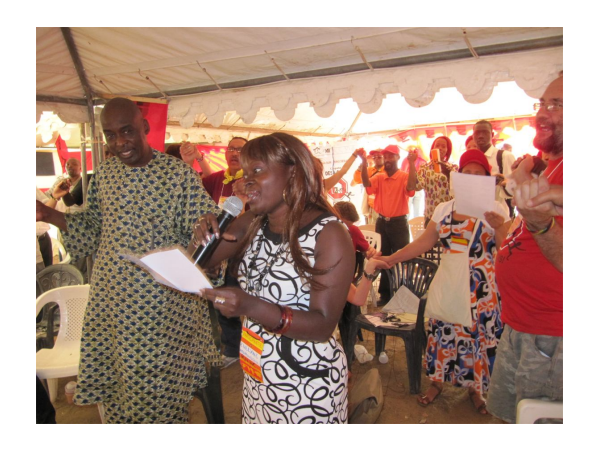
Singing the Inhabitants Anthem (WAI, Dakar February 10<sup>th</sup> 2011)

It goes further than sharing experiences, proposing the task of building concrete solidarity, a common platform, which will reinforce inhabitants' organizations in a few years time and give them the capacity to meet the challenges of the revolutionary and systemic changes that inhabitants need, starting with the fight against evictions, so that they can become the "responsible owners" of their future.