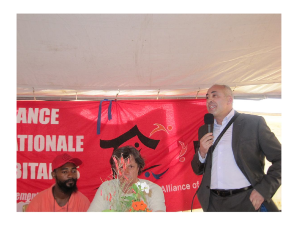
Presentation of the FAL Declaration supporting the WAI at the Village des Habitants (Dakar, February 10<sup>th</sup> 2011)