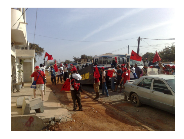
Demonstration against evictions in front of the Ghanaian Embassy (Dakar, February 8<sup>th</sup> 2011)

The workshops and the mobilisation that took place in front of the Ghanaian Embassy emphasised the importance of exchanging experiences in order to develop international solidarity, common strategies, alliances and partnerships with all the participants involved in the creation of an Alternative Urban Social Pact based on human rights. The agreement on the co-ordination of the World Days of October 2011<sup>14</sup>-2012, while concentrating on the fight against evictions in particular (evictions caused by to mega-projects, large-scale events, economic reasons, racism, war, natural disasters, climate change, etc.), is a measure to initiate the creation of common tools (a warning system, mobilisations, agreements with local authorities to issue anti-eviction orders, etc.).