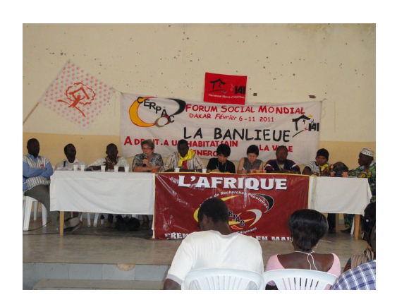
From the working-class neighbourhoods of Dakar to the World Assembly of Inhabitants (Dakar, February 6<sup>th</sup> 2011)