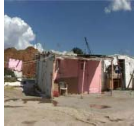
A paranga or shantytown in Athens where Roma families live

authorities in Greece must abide by international human rights law and standards related to the enjoyment of housing rights and ensure that no further violations take place.