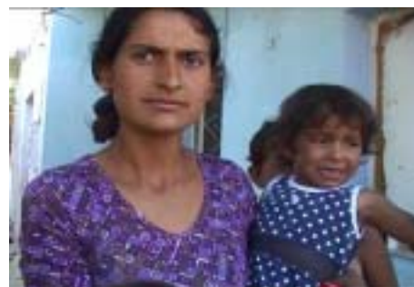
Roma woman with child in Athens

In addition, amendments to the law do not remedy many of the problems that are the basis of the complaint by