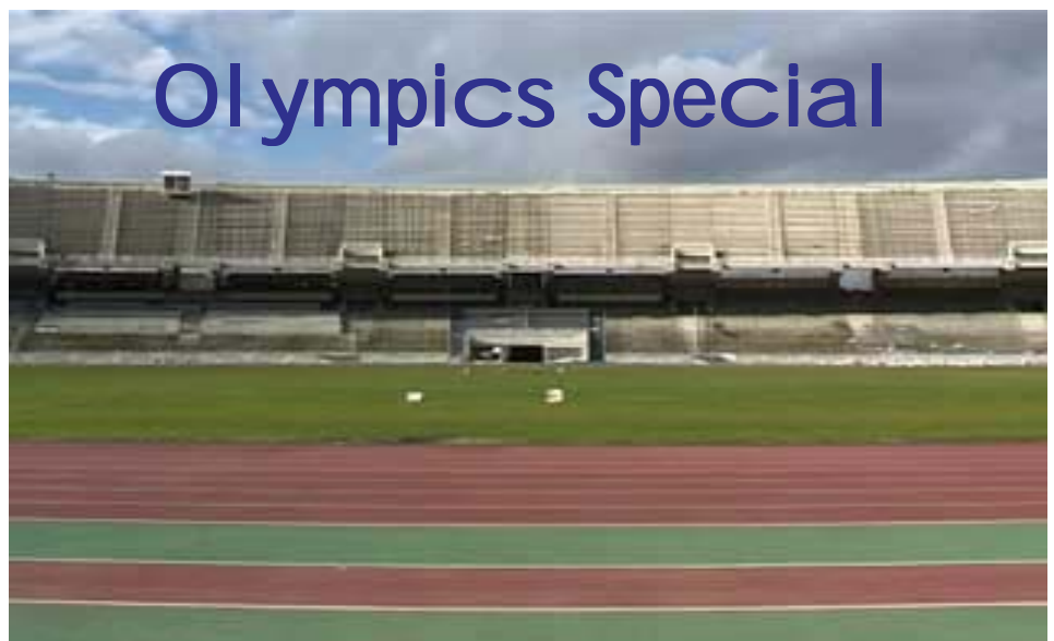
Main Olympic Stadium in Athens

Preparations for the Olympic Games in Athens have been a double-edged sword. While it has created massive employment and economic opportu-