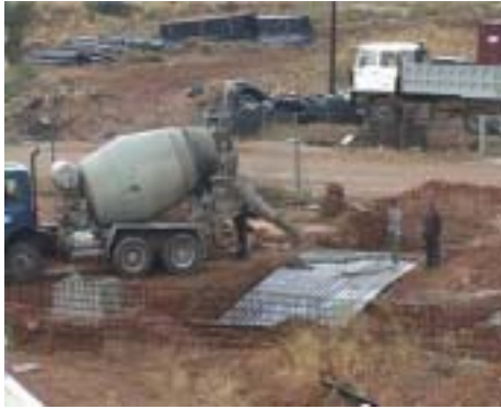
Olympics-related construction in Athens

The run up to the Olympic Games could well bring about further forced evictions of “visible” Roma communities in a last minute bid to “clean up” and “beautify” the greater Athens area, before the world’s cameras descend on Greece.