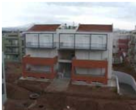
A building in the Athens Olympics Village

Roma families who had moved to rented accommodation struggled to meet their monthly rental payments when the subsidy payments stopped coming from the Municipal Authority. This led to landlords evicting a number of Roma families from their rented accommodation from September 2003. Several of the affected Roma families have voiced their concern that the agreement was merely a pretext to lure them to vacate the land they have been living on so Olympic related infrastructure could be constructed, and that the Municipal Authority of Marousi never intended to honour the arrangement.