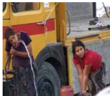
Roma women collecting water on roadside

to the Mayor, payments would resume once all the families had made loan applications. Such a move by the Municipal Authority arguably raises questions about its commitment to abide by its contractual obligations, as no such provision exists in the agreement signed in 2002.