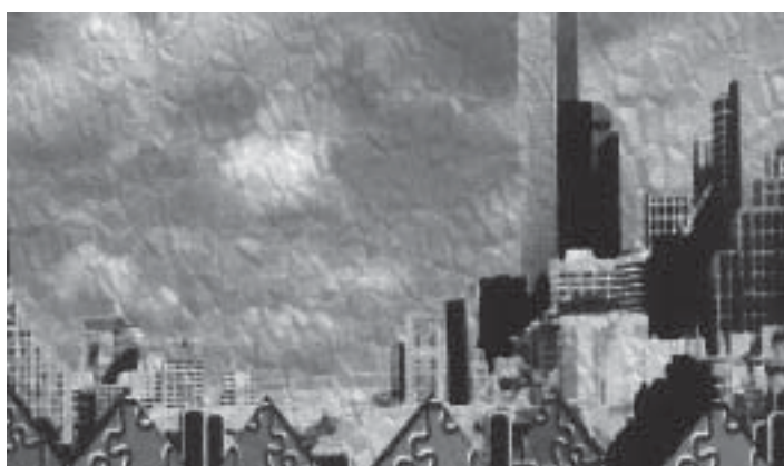
Melbourne Skyline

Public housing is officially in decline in Australia. The Federal Government's 2004 Budget presented in May this year ignores housing-related issues and fails to address the problem of rising homelessness in Australia. There is no real increase in expenditure for the provision of public housing in the Budget despite waiting lists for public housing extending up to 10 years. Though the Budget forecasts a surplus of A$2.4 billion and provides substantial tax cuts for high-income earners, there is no real increase in expenditure on crisis accommodation and support services for people who are at risk of or experiencing homelessness.